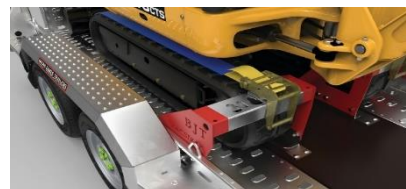
Tracstrap System $810 inc GST